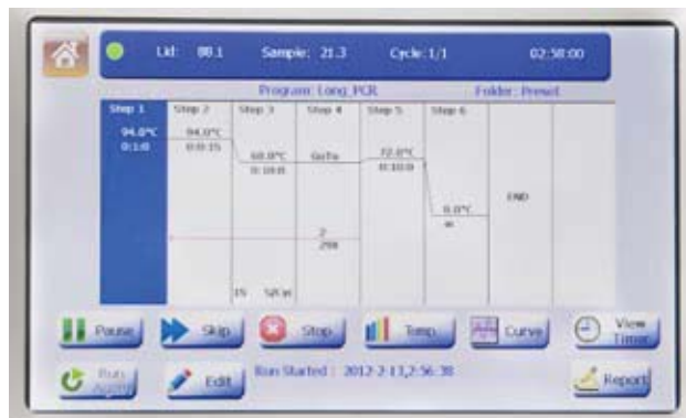
Screen shot of running program